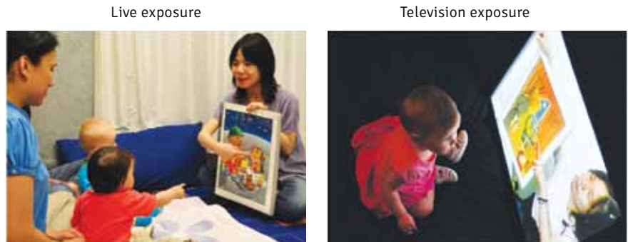
▷ Figure 3b Mandarin Chinese phonetic discrimination